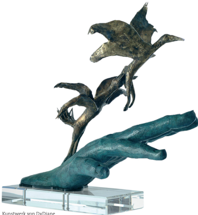
Kunstwerk von DxDiane

Course with Double Workshop from 6.02. - 8.02.2025 Distal radius fracture and associated lesions IRCAD Institute in Strasbourg